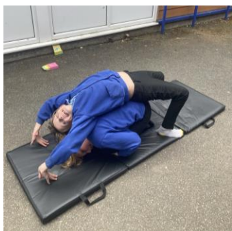
This week's 'Healthy Hugo' task in dosbarth iau was to try out some yoga poses.

Year 2 pupils have been researching animals in Africa during their independent learning this week.